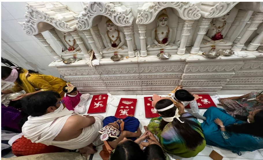
Children taking part in the Ashta Prakari Pooja Vidhi during the Anniversary Program