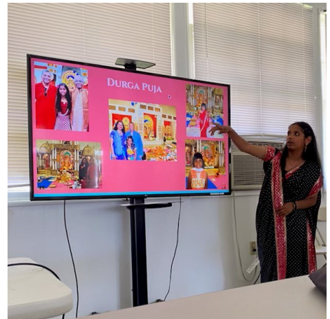
Students dress the part for their finals presentation during Indian Culture Class. Here student discusses the Festivals celebrated in the state of West Bengal.