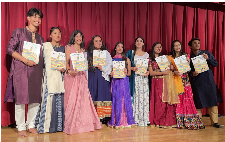
2023 Graduates from JCYC Pathshala recognized at Graduation Garba in June 2023