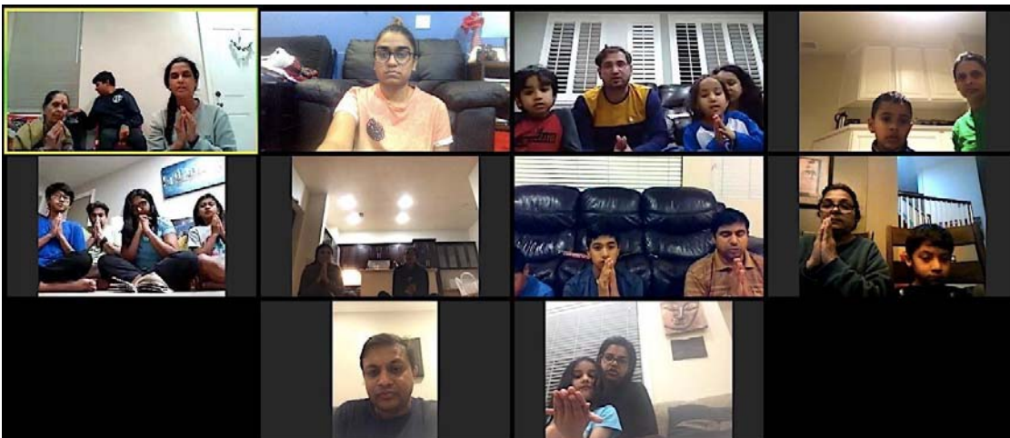
Mommy and Me class conduct evening prayers online.