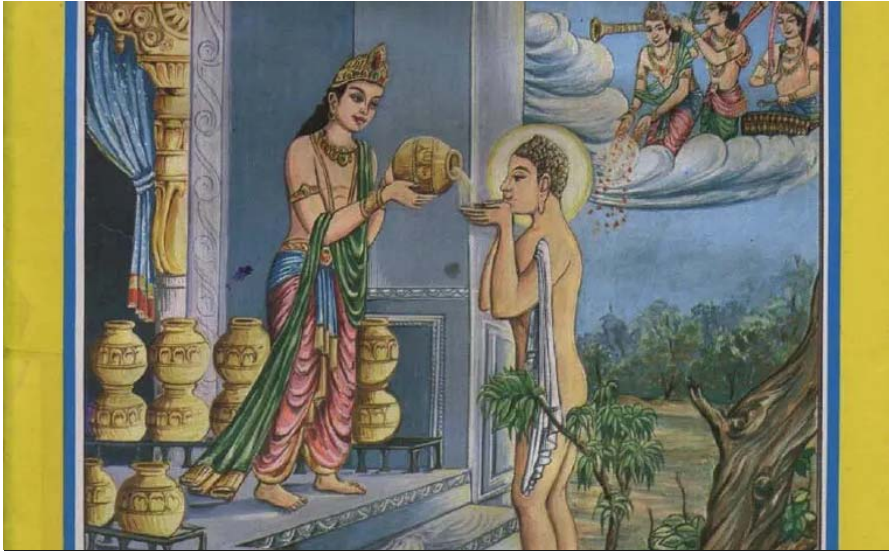
Students can listen to the story of Bhagwan Rushabhdev online