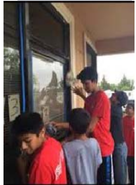
Staying home during the quarantine period is just another way to keep our Jain Center clean.